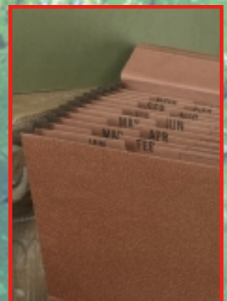
Monthly Expanding File