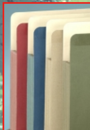
Expanding File Pocket